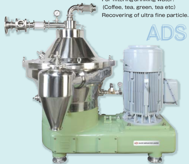
Product to be exhibited : A large machine of disc bowl centrifuges [ADS]

A large-scale centrifuge capable of continuous separation has finally been introduced to the market